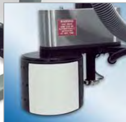
Featuring patented vacuumized drum