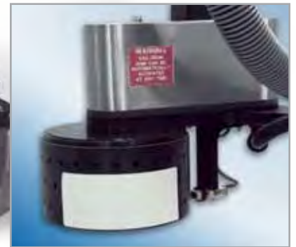
Featuring patented vacuumized drum